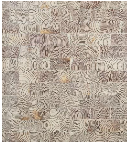
Figure 2: Larch