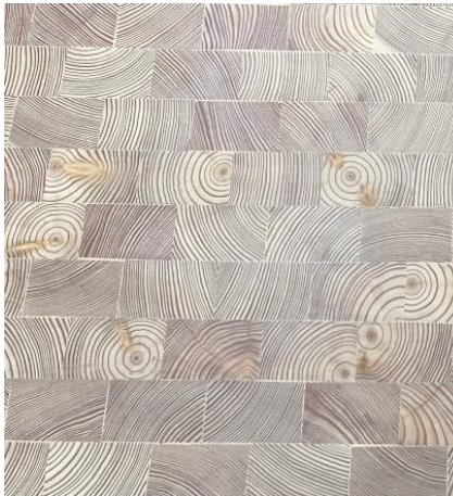
Figure 1: Spruce